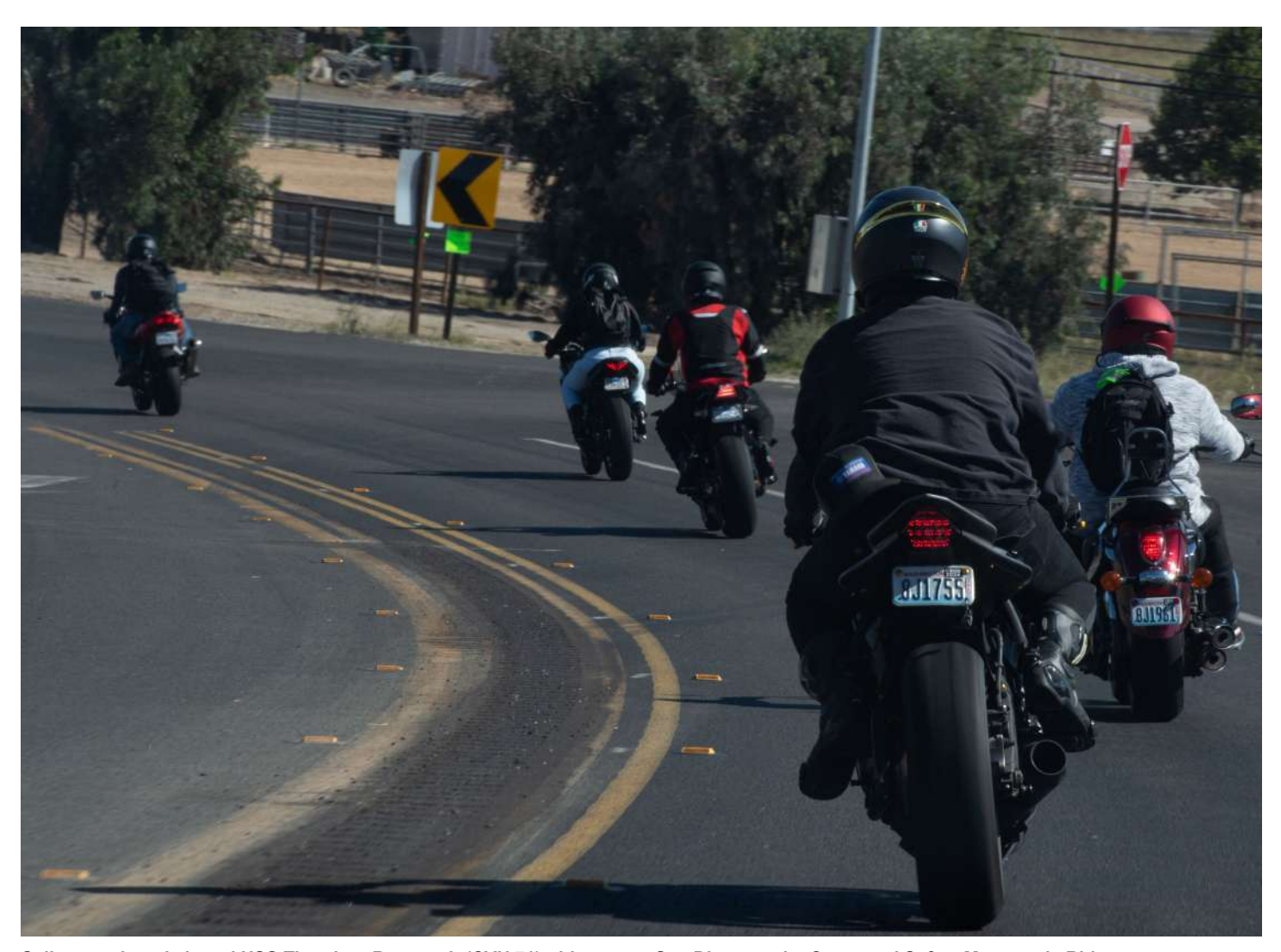
Sailors stationed aboard USS Theodore Roosevelt (CVN 71), ride across San Diego on the Command Safety Motorcycle Ride to promote safety and morale for command riders, Oct. 20, 2023.

Additional Rider Down reports are available here: <a href="https://navalsafetycommand.navy.mil/Resources/Motorcycle-Rider-Down-Reports-newsletters/">https://navalsafetycommand.navy.mil/Resources/Motorcycle-Rider-Down-Reports-newsletters/</a>.